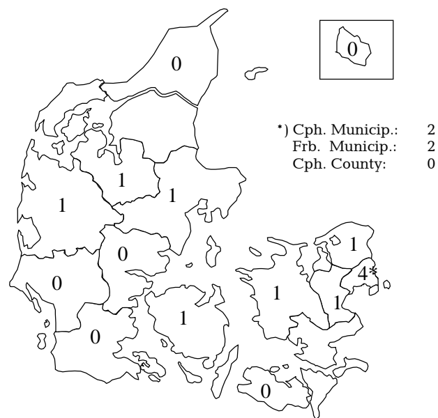
Table 4. Notified AIDS patients by sex and risk group/mode of infection