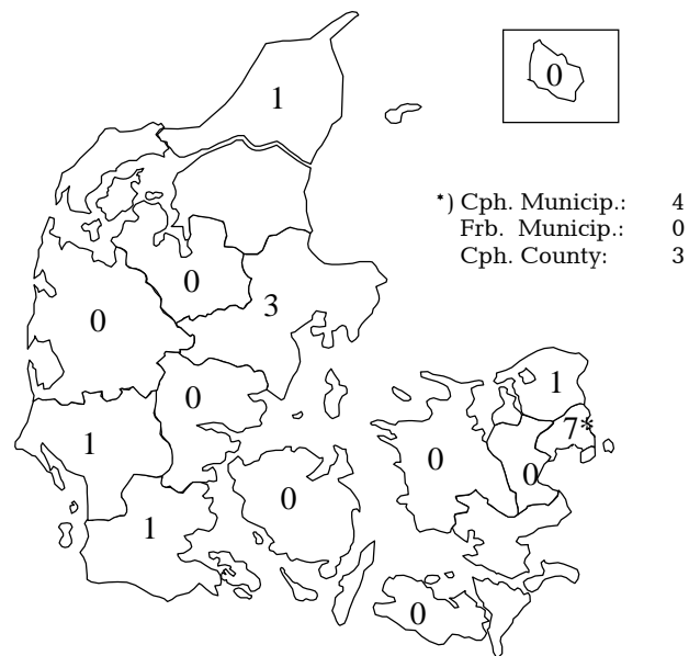
Table 4. Notified AIDS patients by sex and risk/mode of transmission